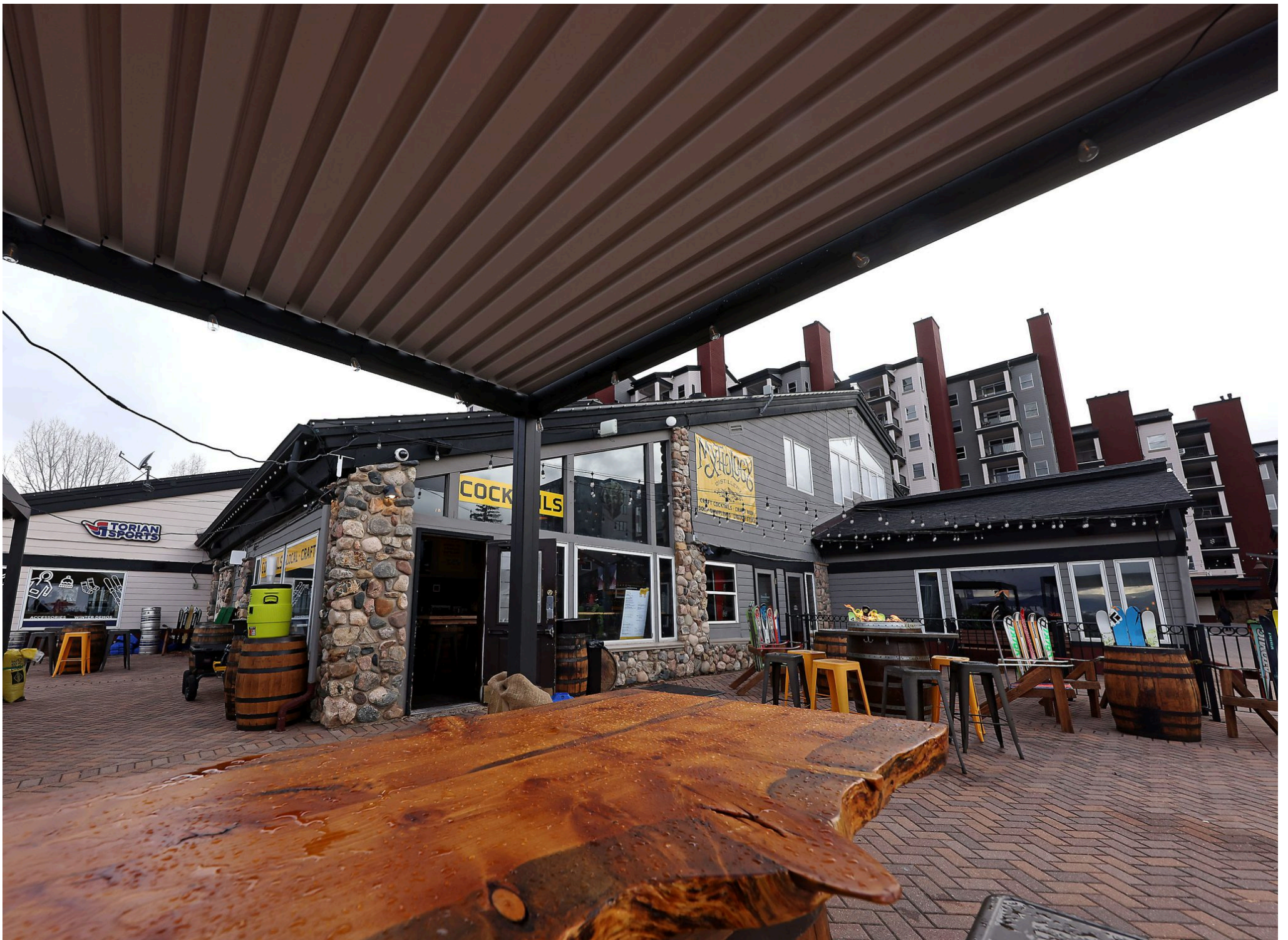
The patio at the Mythology Distillery’s Mountainside & Yield Smash Co. location at the base of the Steamboat Resort awaits the après ski crowd on Monday, Jan. 5, 2026.

The Mythology Mountainside & Yield Smash Co. location is open from 11 a.m. to 6 p.m. seven days a week, and is located just a stone’s throw from the slopes in Torian Plaza. The lease signed this year means the venue will remain at the resort base.